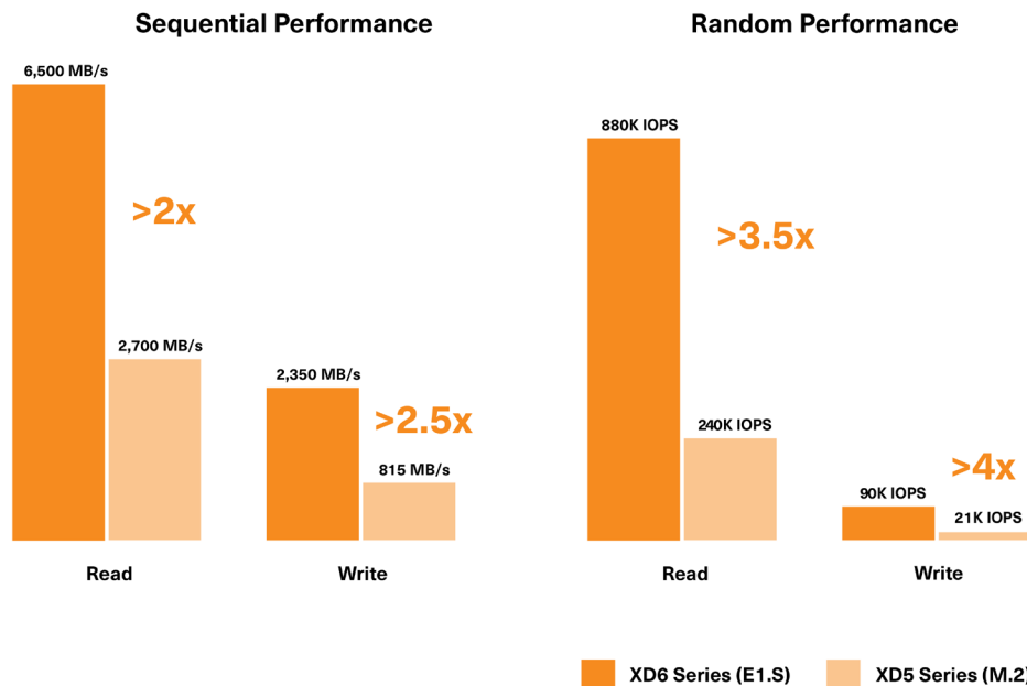
Figure 1: XD6 Series (E1.S) vs XD5 Series (M.2) performance comparisons

Designed for consistent performance, latency and reliability in 24x7 cloud data centers, the XD6 Series delivers 4x greater improvement in random write performance, 3.5x greater improvement in random read performance, 2.5x greater improvement in sequential write performance and 2x greater improvement in sequential read performance when compared to the previous XD5 Series generation (M.2 form factor). The XD6 Series utilizes a purpose-built controller with the latest PCIe 4.0 interface enabling sequential read bandwidth to saturate the PCIe 4.0 bus, transferring data at speeds up to 6,500 megabytes per second 1 (MB/s) (Figure 1).